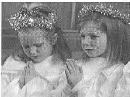
"Angels" like these continue to delight us with their retelling of the story of Christ's birth each year through the pageant.

many offerings, and offered your time and talents to make this place and this world a much brighter place.